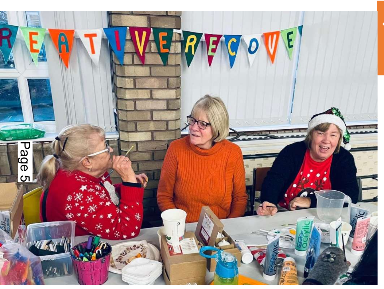
Image: Participants preparing for Kingstone Ward Alliance Pop Up, 21 Dec 2022 – first session at Prospect Street