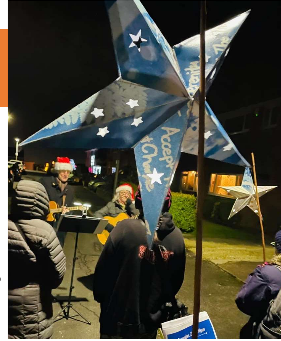
Image: Hope lanterns and Creative Recovery bringing song to streets of Kingstone, December 2022